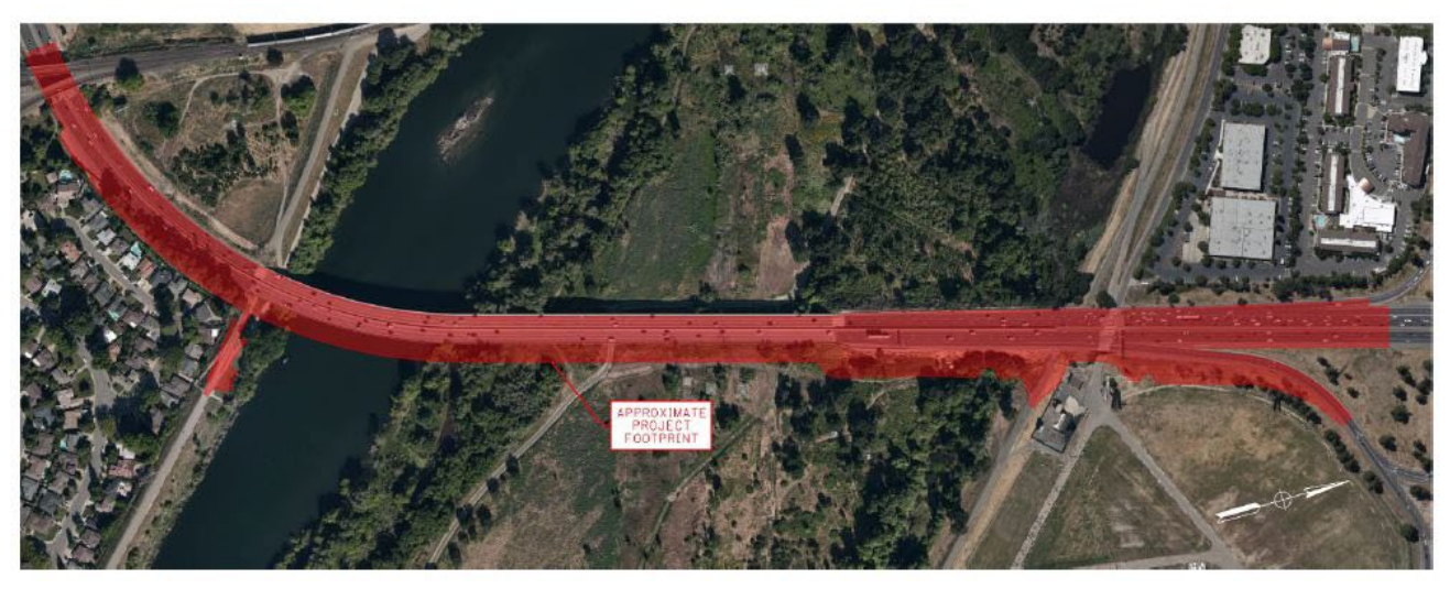
3) Approximate project footprint map